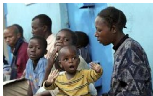
A tough town to be poor in

NAIROBI used to be the green city under the sun. But the population has swelled seven-fold since Kenya's independence in 1963. Large parts of the capital are dilapidated, some are slums so bad that nobody would have thought them possible 40 years ago. One such, Kibera, is set in a hollow by a little stream. Its neighbour on one side is a rich neighbourhood called Langata, on the other side the Ngong forest and Nairobi racecourse. Kibera is home to 800,000 close-packed people. I catch glimpses of it when I drive down to my tennis club. The courts are built on a slope above. After running down a forehand and grabbing for air I sometimes catch a taste of the raw human sewage seeping out of rusted pipes on the other side of the wall.