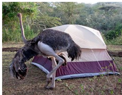
This is your morning call

We're in the Kigio conservancy, a private wildlife reserve between the towns of Naivasha and Nakuru. You reach it down a long dirt road that becomes slippery as ice under the slightest drizzle. The future of conservation in Africa is tied to initiatives such as Kigio. The Malewa river flows slow and brown through the middle of it: there are hippos in the pools. There is a lodge and a camp site (where we are). A glorious walk across a creaking bridge leads you up a ravine to a secret swimming hole.