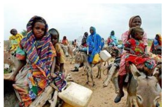
Darfur, an inconvenient truth